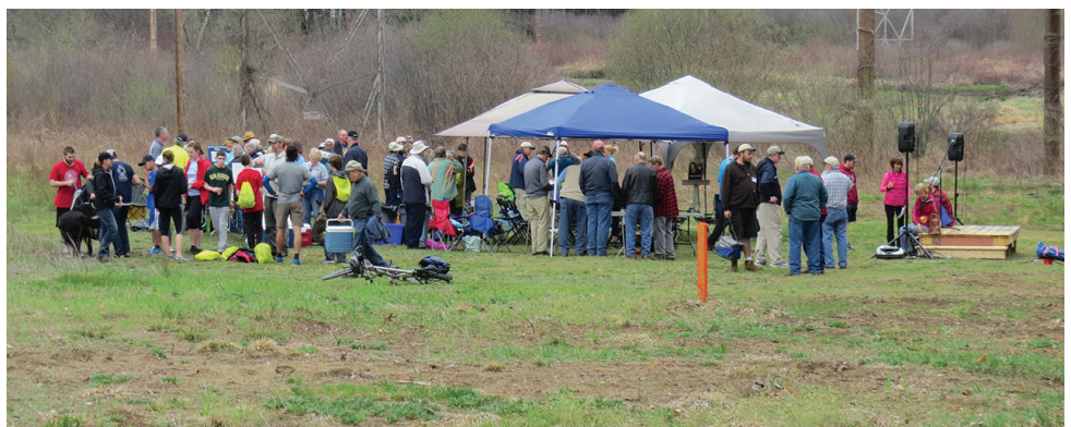
Many of the group of over 120 attendees at the Dedication Ceremony for the Meg Batcheller Trail on 4/23/16 gather for lunch and to hear speakers who emphasized the importance of collaborating to protect the waterfront along the Shawshen River.