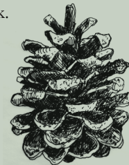
Illustration by Emily Trespas

Details of Registration and Speaker - to be determined. Please check website or Facebook.