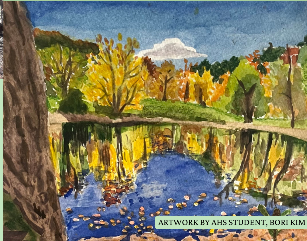
ARTWORK BY AHS STUDENT, BORI KIM

"AVIS manages its reservations to protect native habitat and provide opportunities for the public to experience, enjoy and learn about nature through passive recreation."