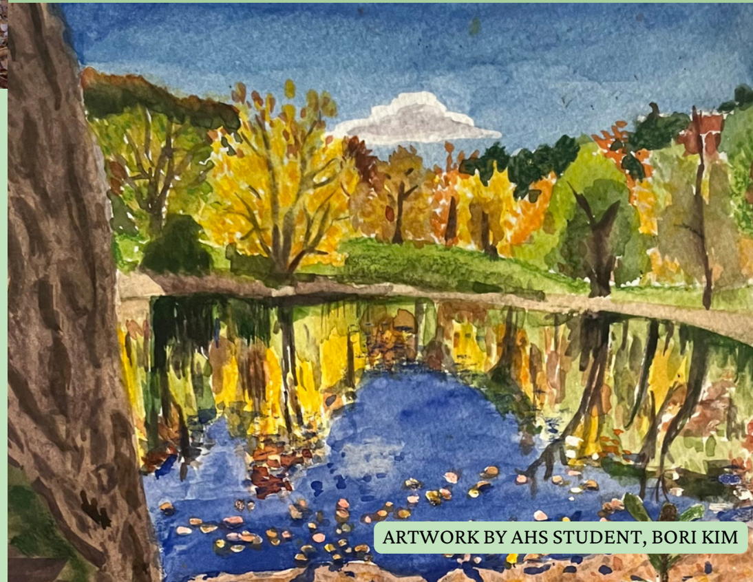
ARTWORK BY AHS STUDENT, BORI KIM

"AVIS manages its reservations to protect native habitat and provide opportunities for the public to experience, enjoy and learn about nature through passive recreation."