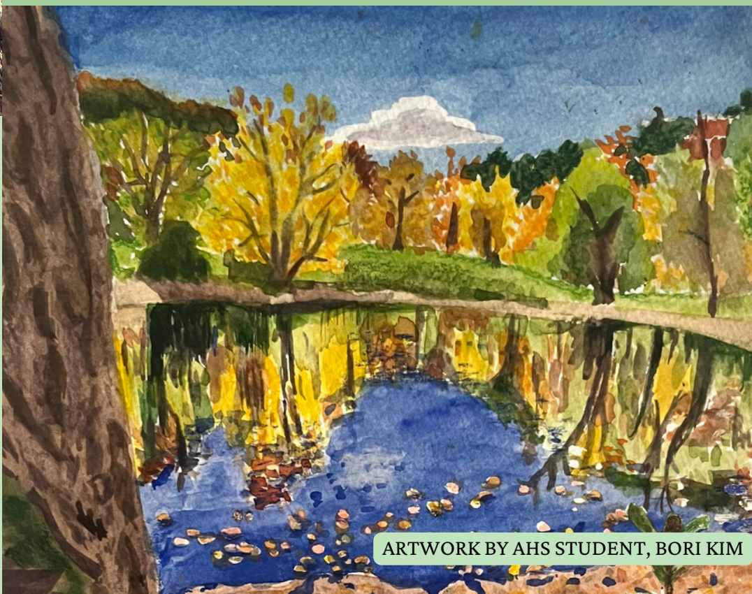
ARTWORK BY AHS STUDENT, BORI KIM

"AVIS manages its reservations to protect native habitat and provide opportunities for the public to experience, enjoy and learn about nature through passive recreation."