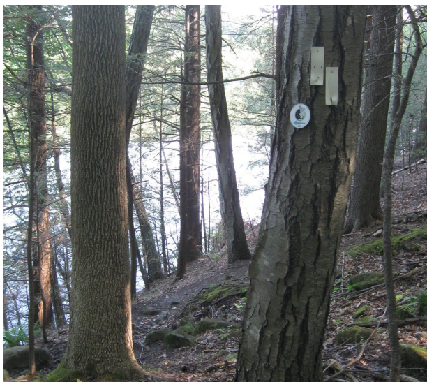
BCT sign on St. Francis Trail.

In addition, the Planning Board Special permit for the Pulte senior housing development requires that the 7 acre Pulte Conservation land be conveyed to AVIS as permanent open space.