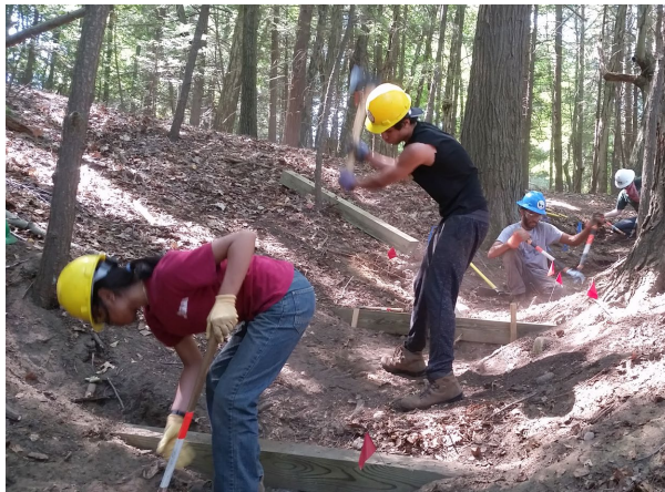
Photo is of an Appalachian Mountain Club Teen Trail Crew improving trails on the Deer Jump Reservation. AVIS relies on volunteers such as these to maintain its trails, meadows, and ponds.

AVIS is a charitable, non-profit (501(c)(3)) organization dedicated to acquiring land and preserving it in its natural state. Founded in 1894, AVIS, is one of the oldest conservation organizations in the country. All contributions are tax deductible in accordance with the law.