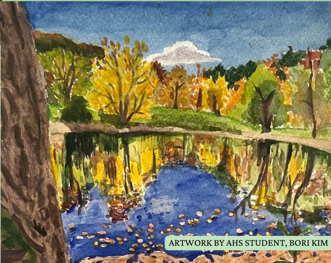
ARTWORK BY AHS STUDENT, BORI KIM

"AVIS manages its reservations to protect native habitat and provide opportunities for the public to experience, enjoy and learn about nature through passive recreation."