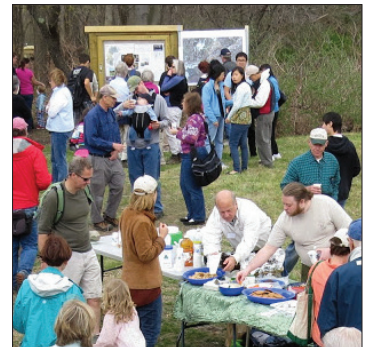
Vale Trail gathering - Some of the 175 people who attended the dedication of the Shawsheen River Greenway.