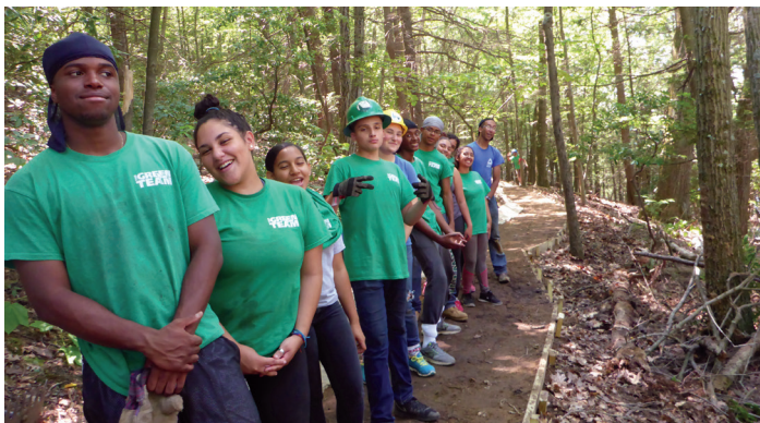
Pictured are members of the Groundwork Lawrence Green Team who, on July 21, 2017, made improvements to the Bay Circuit Trail along the Merrimack River under the supervision of leaders from the Appalachian Mountain Club.