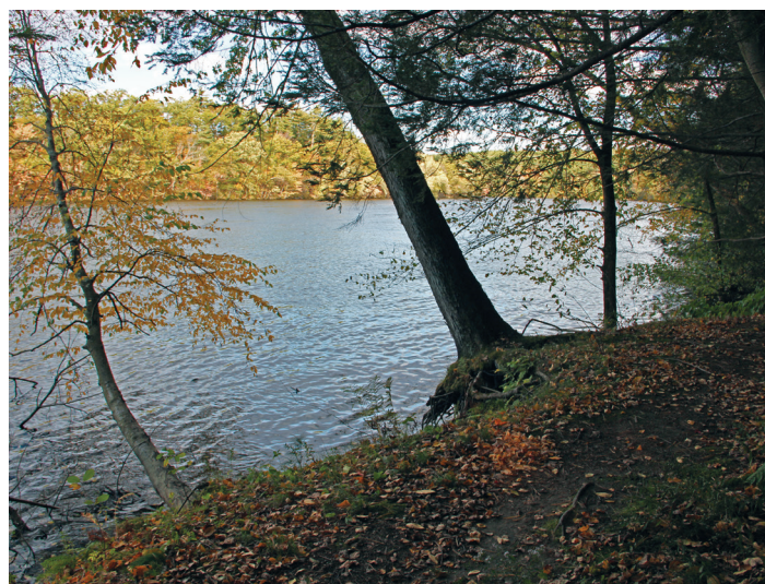
View of the Merrimack River from AVIS reservation.

Please join me for a hike along the Merrimack River on newly acquired AVIS land. Many individuals and foundations contributed to this exciting land purchase, just finalized this spring, which protects our trail along the beautiful river as well as the health of the river. Downstream, the river supplies the drinking water for Lawrence, Methuen, and some of Andover. The trail itself was a pathway for Native Americans long before settlement by Europeans.