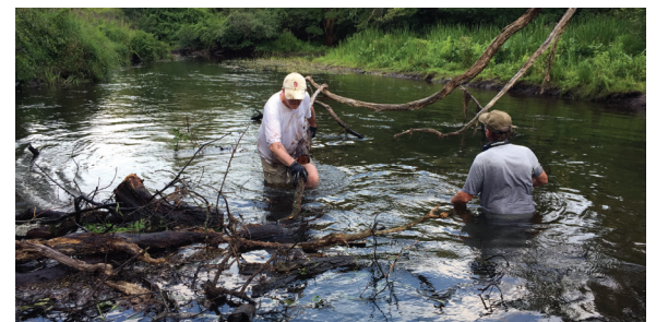
Three new Junior Rangers explore the River wearing their badges in August 2017.