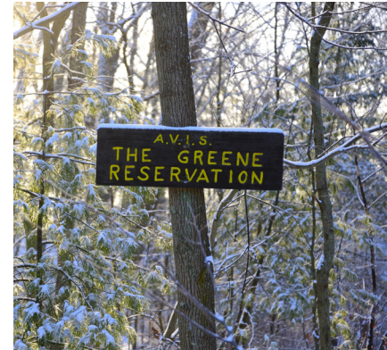
Greene Reservation in Winter.