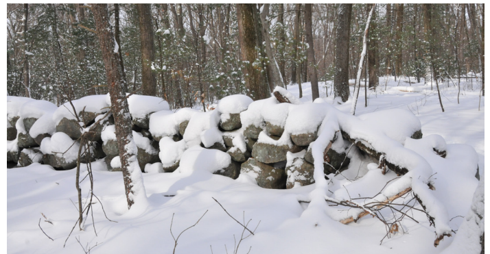
Nat Smith Reservation

The day after the New Year 2014 snow storm, after snow-blowing snow off my driveway and shoveling the front steps, I took the opportunity to go for a walk in the AVIS Nat Smith Reservation at the end of my street. The eight or so inches of accumulated snow was so light and fluffy that it was easy going and I made the full circuit in my snow boots. There was not much sign of wildlife but I did hear a birdcall I did not recognize. It turned out to be a pair of Hairy Woodpeckers deep in conversation, probably about the upcoming nesting season. Of course, I couldn't help thinking that the "woods are lovely, dark and deep" as I crossed the stream at the halfway point. That phrase keeps coming to mind. It was all so beautiful and quiet that I couldn't help think that this is what all the work we put in to AVIS is all about. If places like this were not preserved, the world, or at least our little corner of it, would be a worse place. I hope all of our members, as well as all of our potential members, after fulfilling their "promises to keep" do what Robert Frost didn't have time for when he wrote "Stopping by Woods on a Snowy Evening" and just go for a walk in the woods.