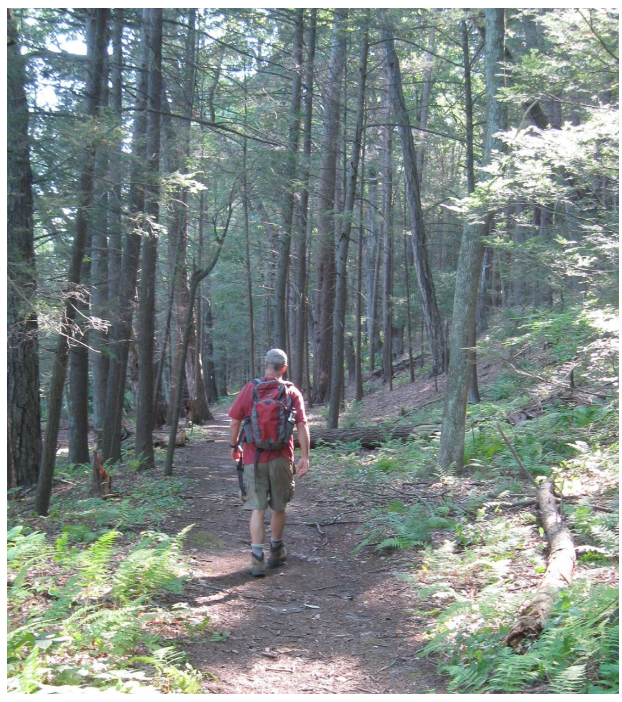
BCT on the Saint Francis Trail.

Protect the Merrimack River and the Bay Circuit Trail (BCT) on the former Franciscan Seminary property