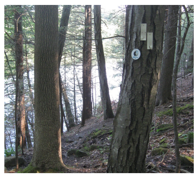
BCT sign on St. Francis Trail.

In addition, the Planning Board Special permit for the Pulte senior housing development requires that the 7 acre Pulte Conservation land be conveyed to AVIS as permanent open space.