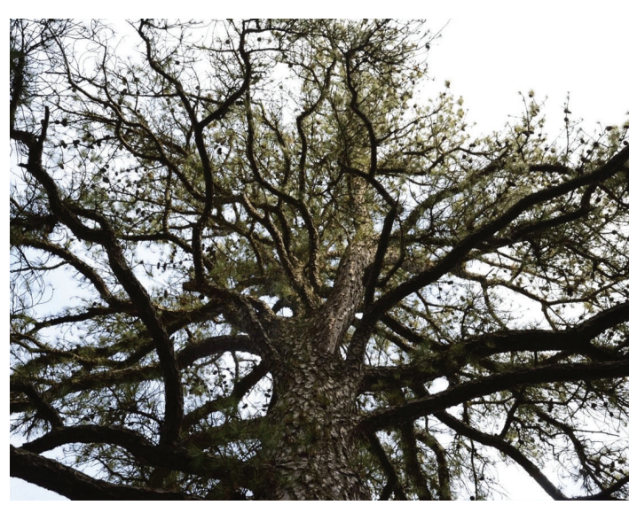
Look for this venerable tree as you trek around the more than two dozen AVIS reservations.

www.avisandover.org 978 - 494 - 6089 facebook.com/avisandover