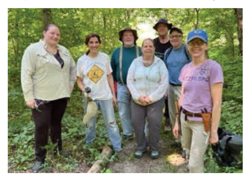
Habitat restoration work continues at the Lupine Reservation. Volunteer Weed Warriors were excited to find that the Japanese knotweed infestation has been largely eliminated through a combination of hand-cutting, chemical treatment and vigilant removal and careful disposal of a small number of new plants. Now that some of the most aggressive invasive plants have been removed, plant diversity is increasing on the property. Last year, the bench on the property was often submerged; this year the river is so dry the shoreline is far more accessible.

Join the Weed Warriors and learn by joining a work party on the reservations. And if you see a group of people working on a reservation near you, come talk to us. We'd love to show you what we're up to.