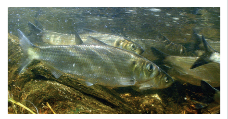
Here are river herrings. (Alosa pseudoharengus.)