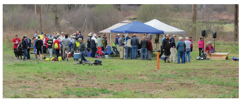
Many of the group of over 120 attendees at the Dedication Ceremony for the Meg Batcheller Trail on 4/23/16 gather for lunch and to hear speakers who emphasized the importance of collaborating to protect the waterfront along the Shawsheen River.