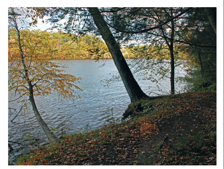
View of the Merrimack River from AVIS reservation.

Please join me for a hike along the Merrimack River on newly acquired AVIS land. Many individuals and foundations contributed to this exciting land purchase, just finalized this spring, which protects our trail along the beautiful river as well as the health of the river. Downstream, the river supplies the drinking water for Lawrence, Methuen, and some of Andover. The trail itself was a pathway for Native Americans long before settlement by Europeans.