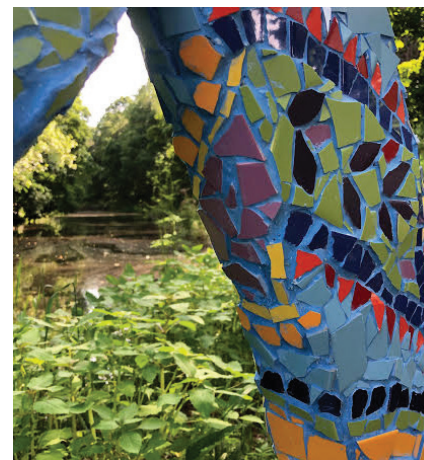
Empty Nest by Cassie Doyon

AVIS Trail: Stanley Reservation: avisandover.org/stanley.html Migration is a series of 125 handmade ceramic containers created by Emily Trespas. The vessels symbolize birds and botanicals; they are also rain gauges, markers of weather patterns and seasons. The installation invites visitors to consider the passing of time and the movement of nature. Trespas's work is grounded in a practice of collecting, re-purposing, and re-interpreting. She is inspired by ideas of absence & presence, and our place and the surrounding world.