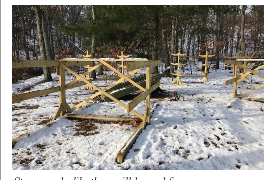
Storage racks like these will be used for canoes and kayaks

Have an old canoe or kayak that you haven't used in a few years that you would be willing to donate for a good cause? The Shawsheen Greenway is working with the Andover's Department of Conservation, and the Recreation Department to develop a canoe/kayak rental program this summer. They are seeking donations of 2 canoes, and 4 kayaks (1 and 2 person) in good working condition to rent to the public for use on the Shawsheen River. If you have one that you would be willing to part with, send an email with a picture and description to shawsheengreenway@ gmail.com Your item will be added to the list to consider for inspection, and pick-up in the Spring when the program is ready for roll out.